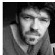
BÅRD IVAR ENGELSÅS

Examples: A Room (short, Cannes entry), The First Kiss (short, jury prize Clermont Ferrand), My Real Mother (doc. entry Input festival in Mexico), Pin Up (Best Nordic Short, Best Int. prod. at London Short Film Festival and more), My Uncle Loved the Colour Yellow (Jury special prize in Berlin Film Festival and more.)