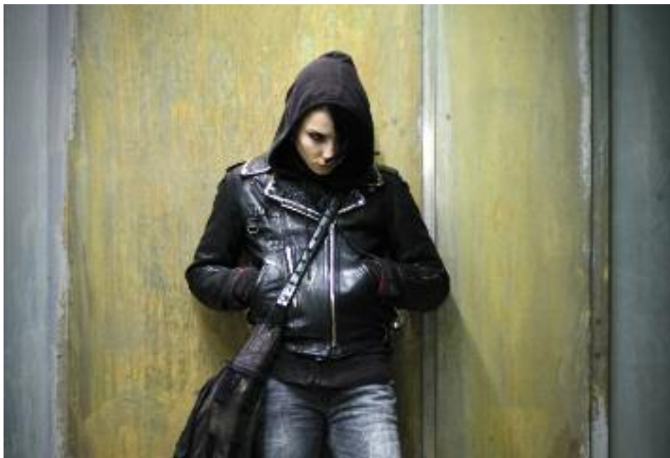
Noomi Rapace as Lisbeth Salander in the Millenium Trilogy (2009)