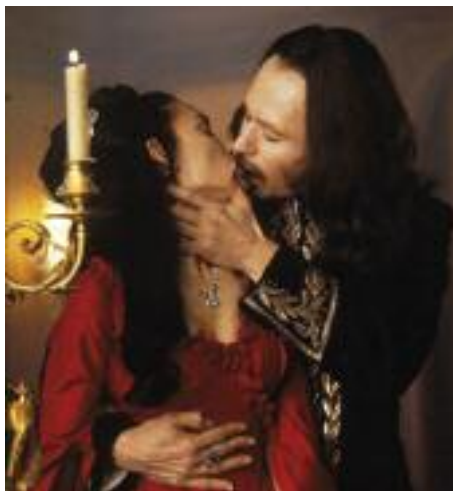
Bram Stoker's Dracula (1992)