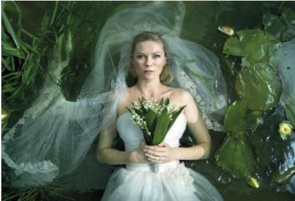
Kirsten Dunst in Lars von Trier's Melancholia (2011)

Erich Pommer Institut (EPI) is an institute for media law, media economy and media research that provides practice-oriented research, academic teaching, industry training and media consultation. Each year, EPI organises and hosts around forty seminars, workshops, conferences and panels – both for the German as well as the European and international media industry.