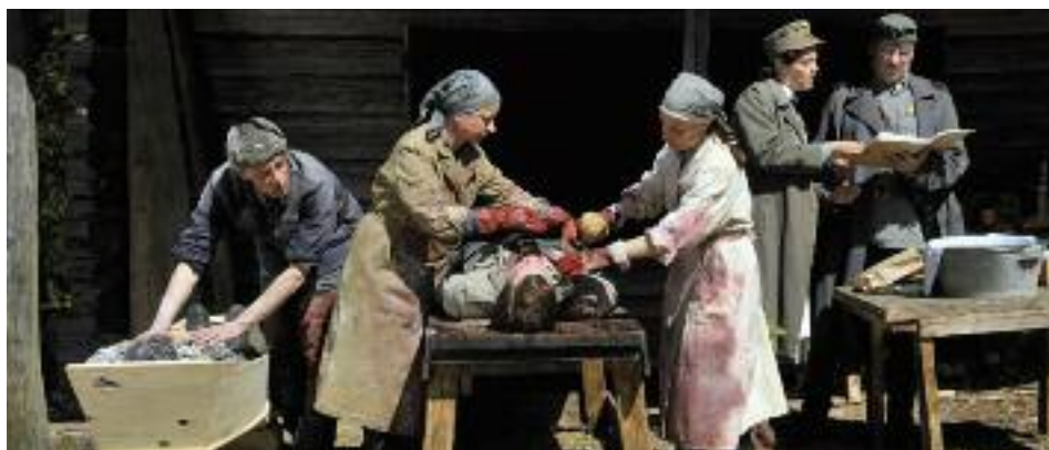
Silence (2011), pitched at the Co-Production and Film Financing Forum in 2010.