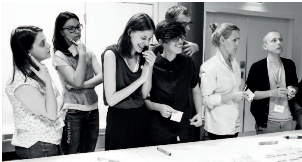
EAVE European Producers Workshop.